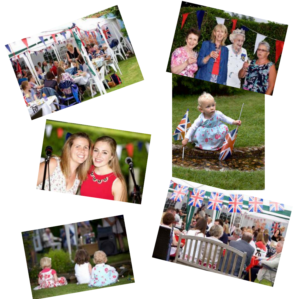
See more at spaldwick.com