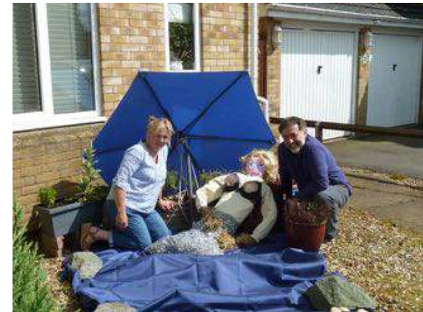
MERMAID, IVY WAY

One of the first scarecrows this year. There is still time to join in. Straw available at 43 High Street