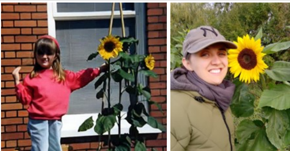
Above: Our daughter still loving growing sunflowers after all these years.

Now in our third year, it's just starting to look good and largely done with the same 'make do and mend' attitude of my dad and the post war generation - albeit with a modern twist thanks to Market Place and the like. Sadly, my dad has dementia now and, although his beloved greenhouse still stands (mostly!) his allotment is long gone. But both my parents loved it when they were finally able to pay a visit to ours this year - although neither of them or our daughter can believe we're still at it. And neither can we!