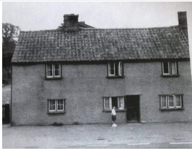
Image: See historic photos of Spaldwick and learn more about the history of the village, at the BBQ on Friday 19th August.

As well as a large range of library books, you can get your NHS hearing batteries and replacement walking stick ferrules. You can dispose of old household batteries.