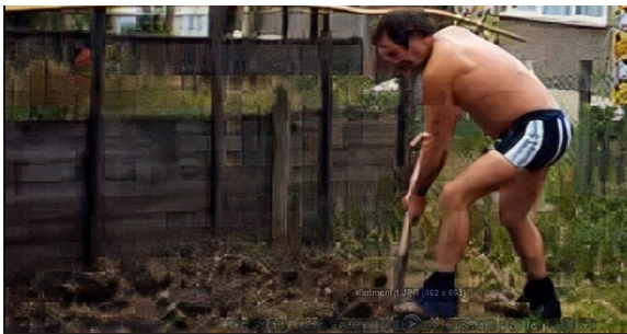
Above: Dad tending his allotment in our garden in Liverpool, c1978 - and (below) with my Mum in our greenhouse, January 2022.