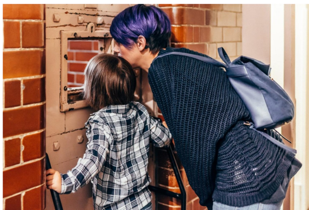
Discover our Edwardian police cells

Year 6 to 66 Come along and learn to ring 4 bells were cast in 1635 (Reign of King Charles I) And 2 in 1921 They weigh from Treble 6cwt 2qtr - Tenor 12cwt 2qtr Treble 315kg - Tenor 620kg Try lifting that at the Gym!! Email: spaldwickbells@gmail.com