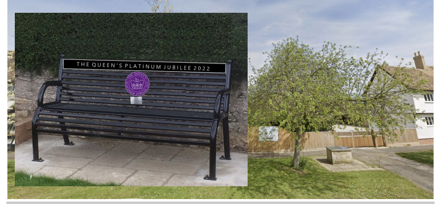
How will London Luton Airport's airspace change affect Spaldwick?

There is also the purchase of a commemorative "The Queen's Platinum Jubilee 2022" bench seat for the village, which will be placed between the trees by the Jubilee plaques near The George.