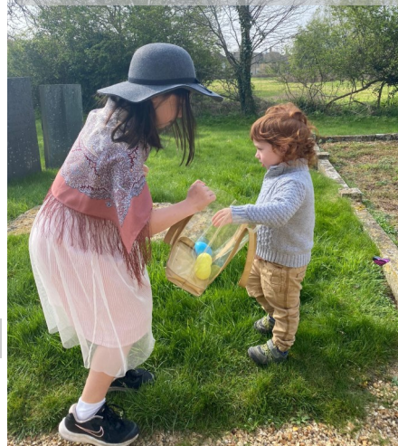
Look out for more of these...

Visit St James Church on 1st May to find out more - or wait until June's Spaldwick News!