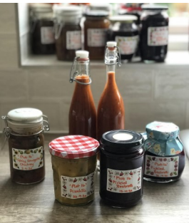
BELOW: Preserving our harvest is always good fun and makes nice gifts for people.

Michael's parents love to come down and help. Always time for a picnic and catch up with Graham about the North East!