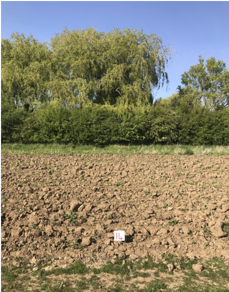
RIGHT: April 2020 Plots allocated numbers and all measured out. Now the hard work begins!