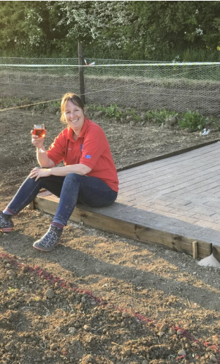
LEFT: May 2020 celebrating the patio completed!