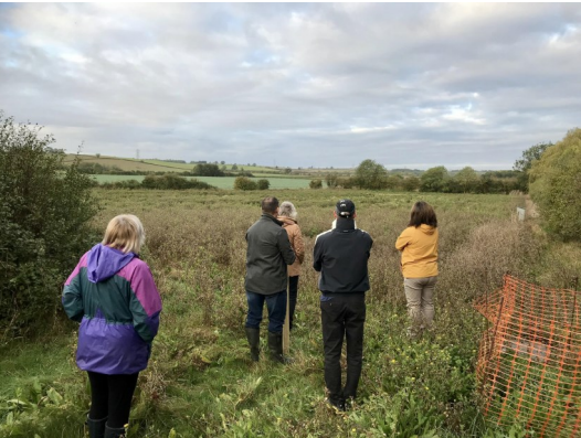
ABOVE: October 2019, first site visit from Spaldwick Community Allotment Association (SCAA)

Contact us on spaldwickallotments@gmail.com