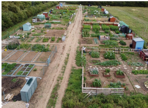
BELOW: August 2020 The allotments were such a huge benefit for well-being during the pandemic and lockdown periods.

Michael's parents love to come down and help. Always time for a picnic and catch up with Graham about the North East!