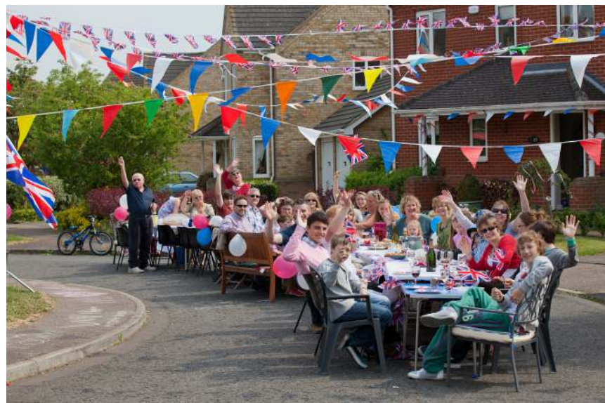
Ivy Way Royal Wedding Street Party Pictures of the Royal Wedding Garden Party inside