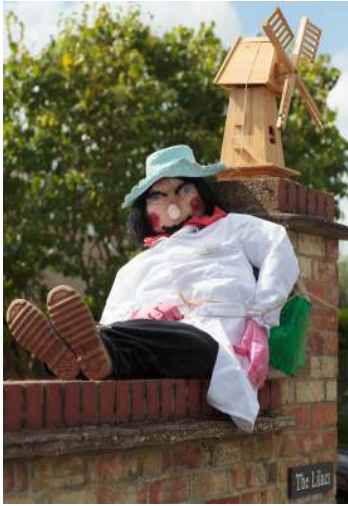
The Miller's Arms