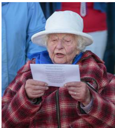
From the Oldest