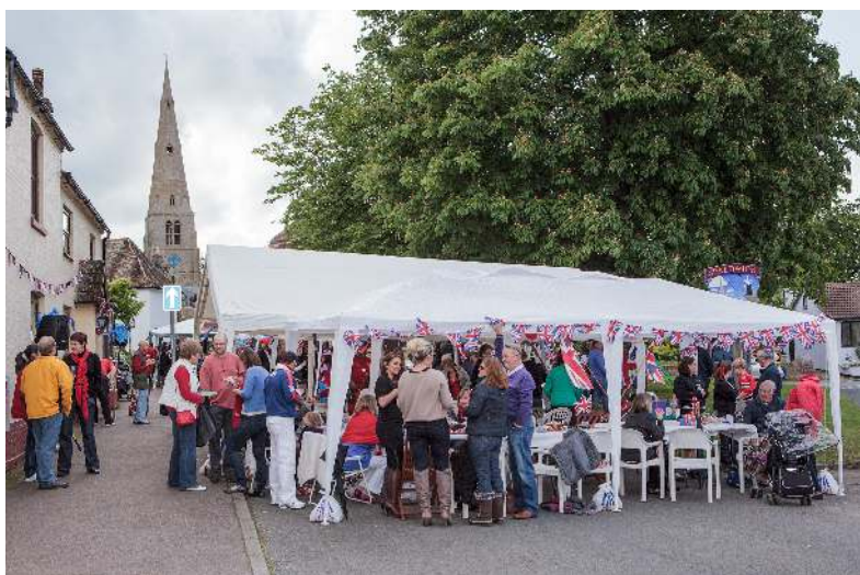
Everyone enjoyed the Jubilee Tea Party