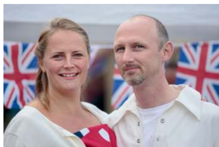
With some in between