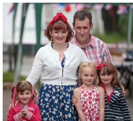
to The Youngest